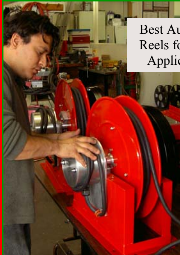
Best Automatic Reels for Truck Applications

For Reel models & specification, see the price list, Page 3